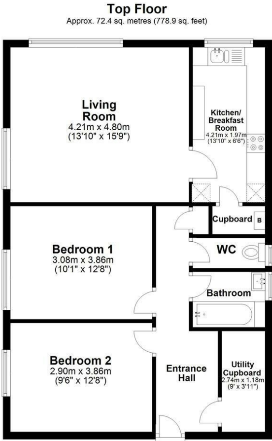
Total area: approx. 72.4 sq. metres (778.9 sq. feet) Sketch layout only. Not to scale. Plan produced for Whittaker & Co.